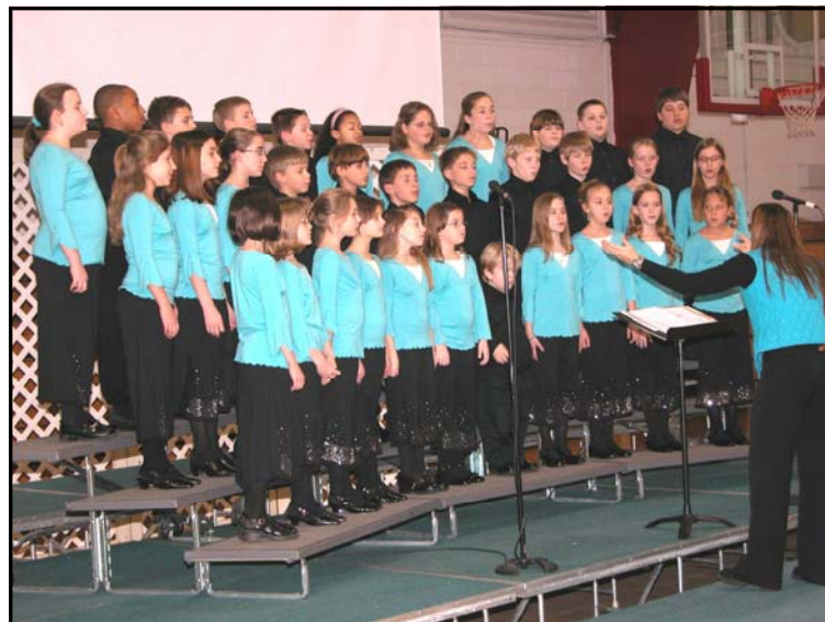
The Musicians in Motion (M&Ms) , are an audition choir at Liberty Christian School.