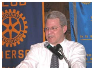
You can hear the mayor Wednesday evenings, from 6 to 7 on 1240 AM WHBU.

The plan is to avoid police and fire layoffs as our financial challenges grow. In other areas, however, job functions